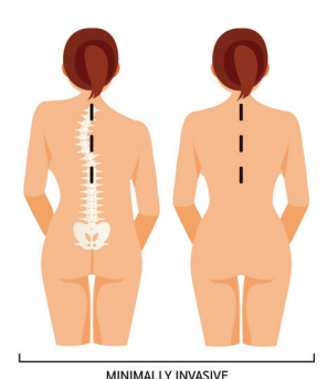
EN TECHNIQUE MINIMALLY INVASIV